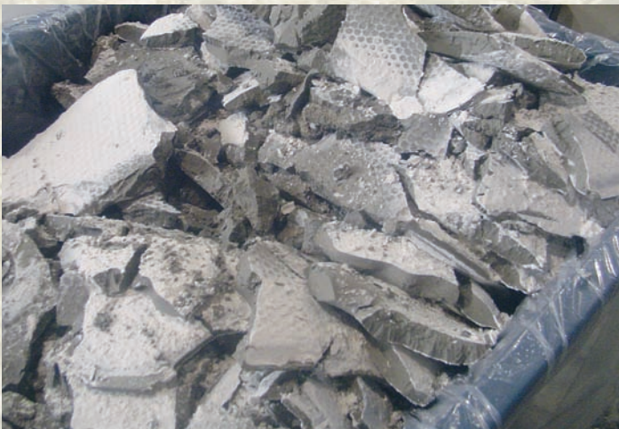
Dry, landfillable filter cake after wastewater processing with a Beckart system.