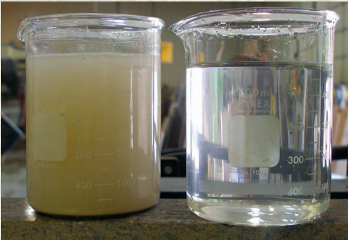
Actual water samples before and after processing with a Beckart system at a Midwest stone fabricating facility.