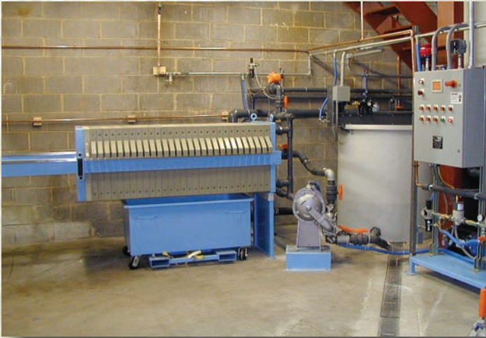
Beckart automated systems are regulated by PLC controllers that we assemble and program in-house. The system makes all of its own wastewater staging and sequencing decisions, and fine tuning, diagnostics and adjustments are easy to facilitate.